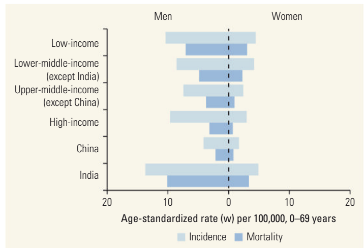
Figure 5.1 Age-Standardized Incidence and Mortality Rates of Oral Cancer, by World Bank Income Classification, 2012

Oral cancer incidence and mortality rates have been declining steadily in most European countries over the past two decades; until recently, rates had been